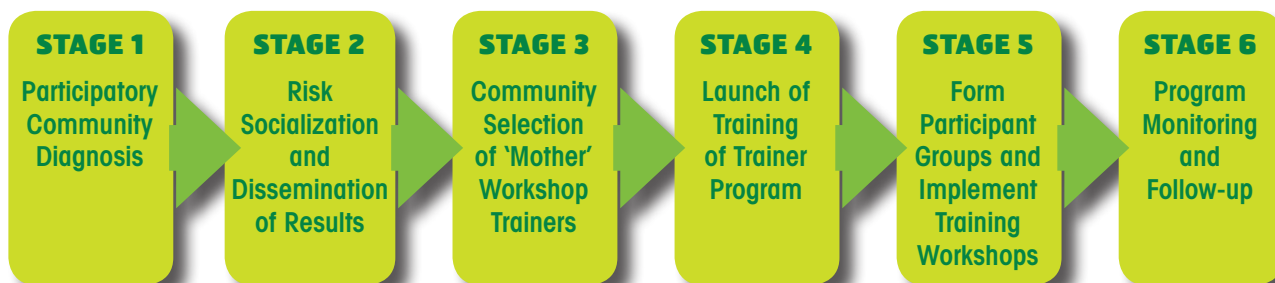
FIGURE 2 – STAGES OF CHILDFUND ECUADOR’S PARENTING EDUCATION MODEL

ChildFund’s parenting education model covers all aspects of early childhood development: physical, emotional, social, and cognitive. It is organized in five units and contains 26 key messages. The model is based on participatory methodologies and adult learning theories, and on the United Nations Children’s Fund messages for care and development. The parenting education model is delivered in communities, as a training of trainers with volunteer Mother Trainers. The model is delivered along six steps.